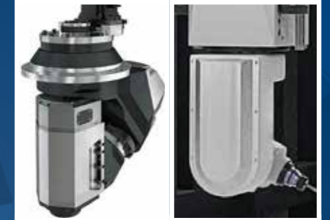
Different options for Head and Electrospindle