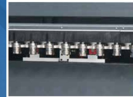
Automatic tool change system

A robust, high-performance system that allows the creation of highly complex parts quickly and easily, capable of performing in all possible machining jobs. It offers great performance and precision thanks to its very complete control system and CNC technology.